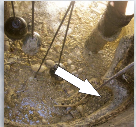
After 12 weeks, grease collar continues to erode, grease balls remain smaller in size with more clear water visible throughout.