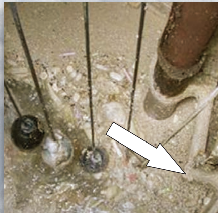
Grease layer significantly reduced with clear water showing after 4 weeks.